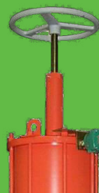
Mechanical Manual Override