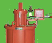
Hydraulic Manual Override